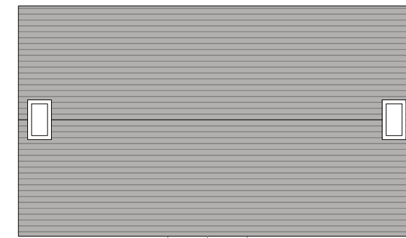
Type C1 Roof Plan