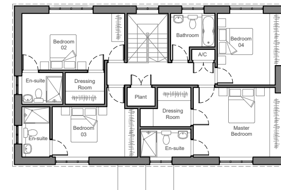
Type C1 First Floor GIA: 108m 2