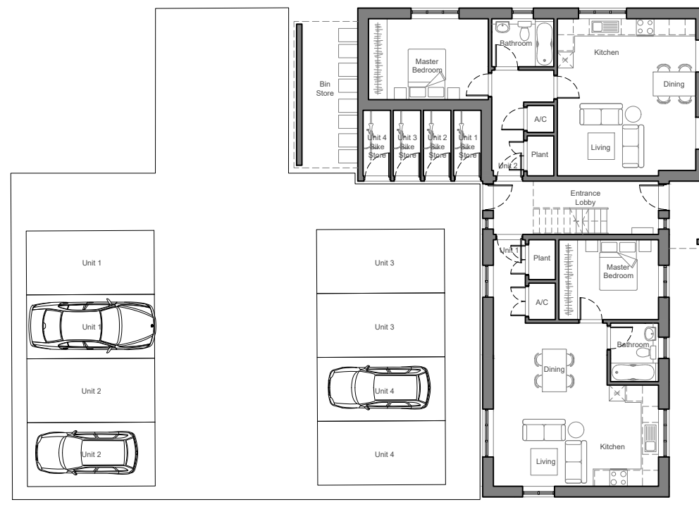
Type A1 Ground Floor